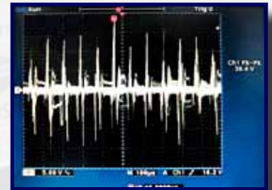
Shaft voltage reading with no protection

The use of variable frequency drives (VFD) with AC motors induce electrical voltages on the motor shaft. Once they exceed the resistance of the bearing lubricant, these voltages discharge to ground (typically the motor housing), causing fusion craters in the bearings. Over time, these craters increase in size and number, resulting in frosting, pitting, fluting, and eventually bearing failure. This type of premature bearing failure can cost thousands of dollars in increased maintenance and lost production.