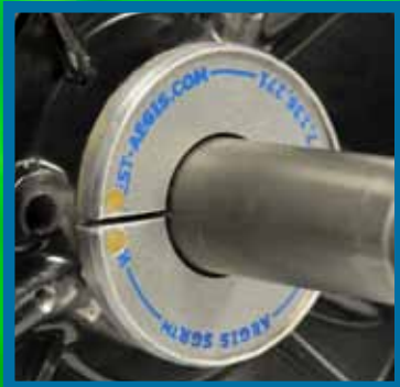
AEGIS™ SGR - Split Ring