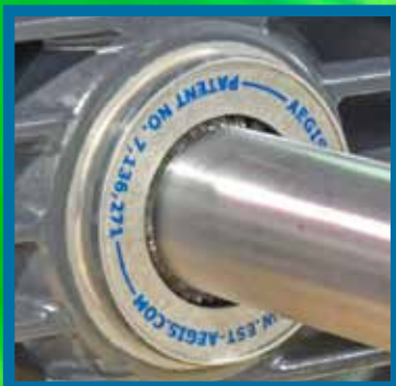
AEGIS™ SGR - Solid Ring