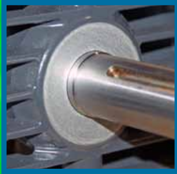
End bell with cleaned surface