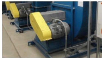
Teco 254T motor driving a RF4 AHU