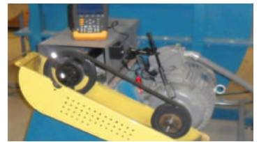
Testing the motor for shaft currents