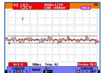
With AEGIS® SGR: 1.92 V peak-peak