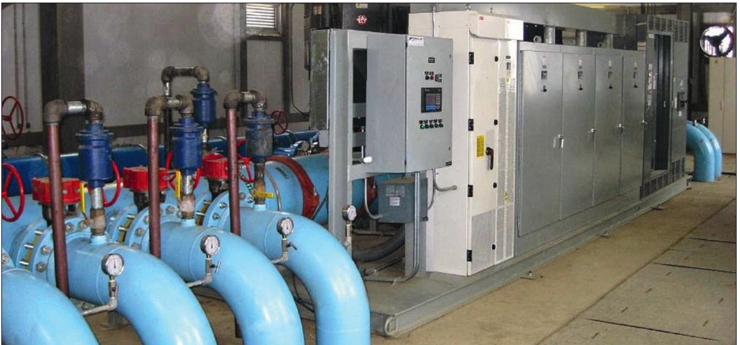
Pump station to increase pressure