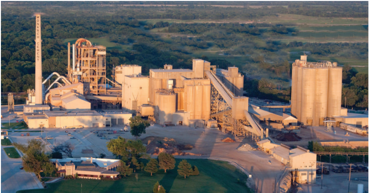
Monarch Cement Company's plant in Humboldt, Kansas